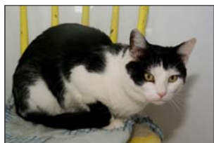
Tommy adores New Ash Green