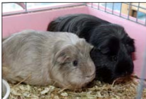
Lola and Lily love Welling