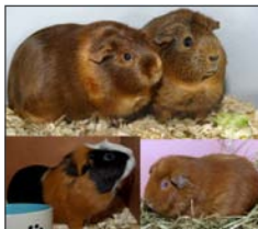
Coco, Chocolate, Sally and Patch like Wainscot