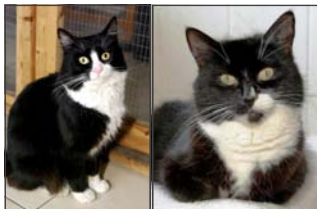
Pepe and Poppy are happy in Frindsbury