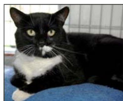
Roger likes Bexleyheath