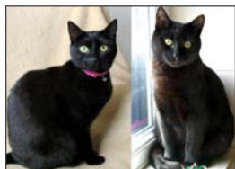
Coco and Milo play together in Dartford