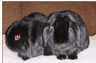
Snoopy and Sooty live in Sydenham