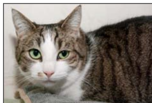
Caoimhe has settled in Abbey Wood