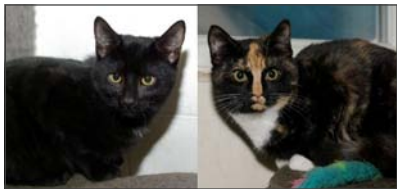
Dougal and Elsbeth play in Sevenoaks